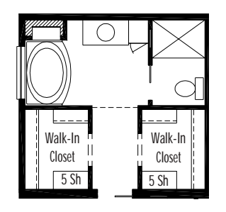
Master Bath Option KWB1 Single Vanity and Linen Cabinet Available on A, B, C and D