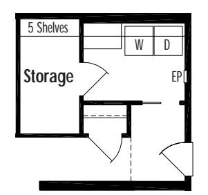
Utility Room Option KWU1 Hall Closet (A and B Only)