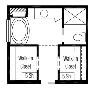
Master Bath Option KWB1 Single Vanity and Linen Cabinet Available on A, B, C and D

Kenwood A Crawl Space 27'-4"x 56' 1531 Sq. Ft. Living Area