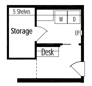
Utility Room Option KWU3 Desk with Lap Drawer and 48" Wall Cabinet (A and B Only)

Floor plan dimensions are approximate. Artist's floorplans, elevation renderings and photographs are for illustration purposes only and may include optional features. Garages, porches and other attachments are not included unless specified in the written contract. All construction details and specifications must be written in the contract. No oral conditions.