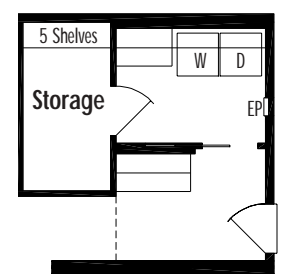
Utility Room Option KWU2 Drop Zone with 48" Base and Wall Cabinets (A and B Only)